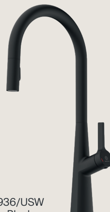
700936/USW Matte Black