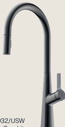
700932/USW Matte Graphite