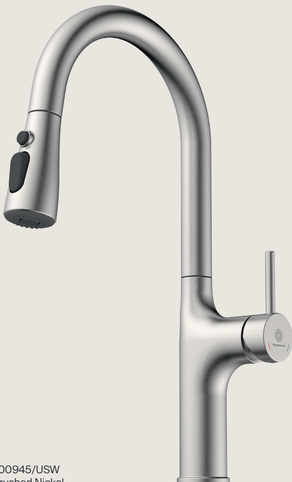
700945/USW Brushed Nickel