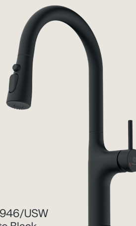
700946/USW Matte Black